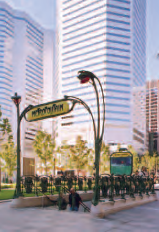
This Hector Guimard subway entrance was a gift to the city from France.