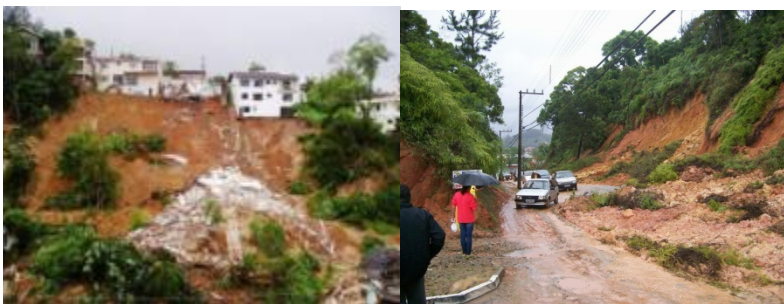
Figure 3 – Landsliding