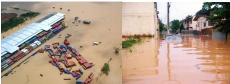
Figure 1 - Blumenau City

Local authorities of 14 counties decreed an even harsher measure called “state of calamity” which demonstrates the worst cases. Among these is a major city – Blumenau - with 300 thousand inhabitants suffered by inundation, land sliding causing 3.000 to lose their home and more than 18 thousand residences were damaged forcing 20.000 citizens to quite temporarily their houses.