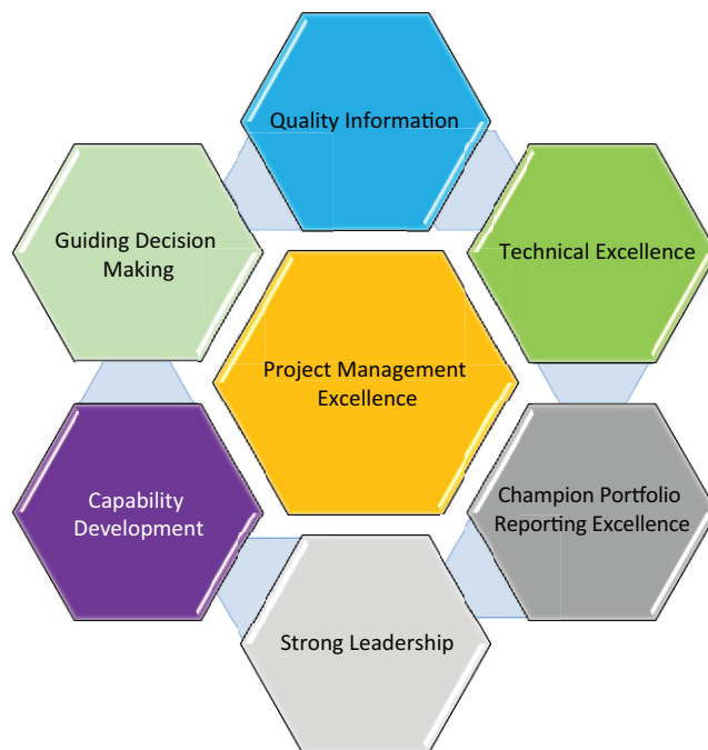
Figure 2: The constitution of project management excellence in the IMED